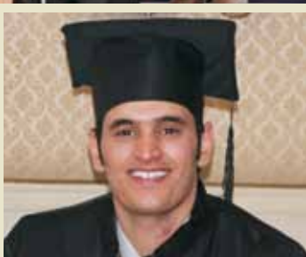
Members, families, friends, and special guests, attended from countries worldwide including: Egypt, Ethiopia, Kuwait, Nigeria, Oman, Qatar, Saudi Arabia, Sierra Leone and Yemen, many are pictured here