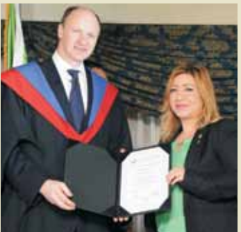
The Graduation was a spectacular and happy occasion; nearly 200 attendees received CIC awards